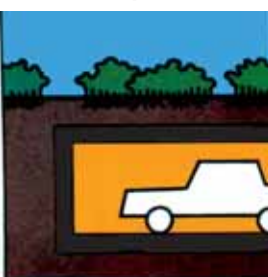
Waterproofing underground construction