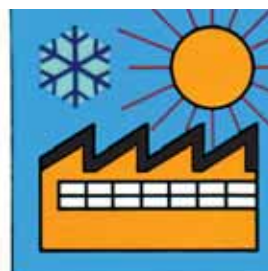
Resistant to high and low temperatures