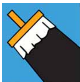
Liquid for manual and spray application